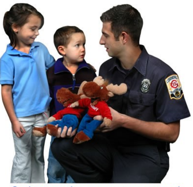
Service man and women emergency personnel can ease frightened or confused children by giving them a Tommy Moose plush doll