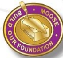
Moose Legion Pin