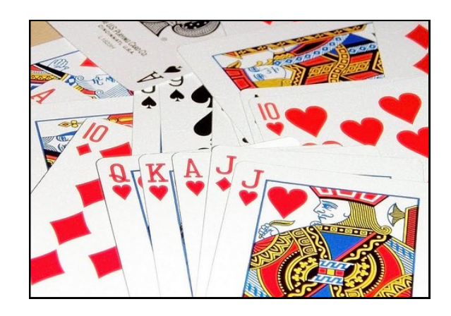
Euchre Tournaments Every Third Sunday at 1:00 pm

Horse Shoes are played every Wednesday evening at 6:30 pm. The first season is coming to a close- refer to the Lodge Sports Bulletin board for information on a second season to begin a few weeks after the first begins (providing there is enough interest)