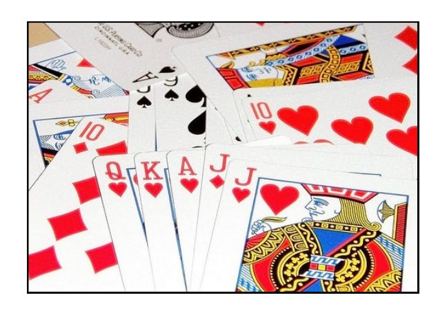
Euchre Tournaments Every Third Sunday at 1:00 pm

Its almost time again for winter sports! Keep watch on the Sports Board for news about joining dart leagues.