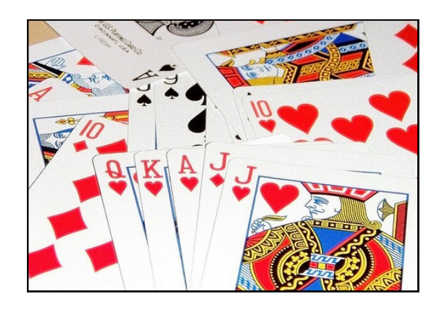
Euchre Tournaments Every Third Sunday at 2:00 pm

Our Horseshoe Leagues will start this May 14th and 15th. Sign up & get more information at the Lodge.